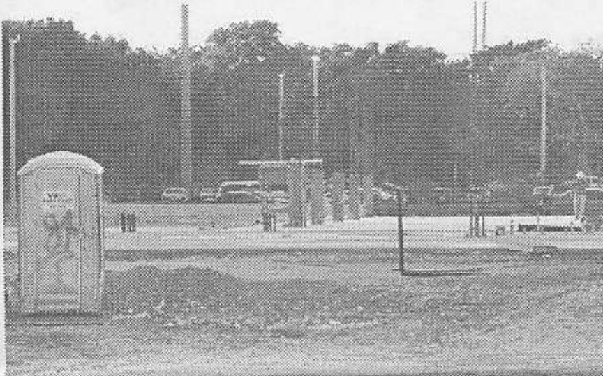
Construction under way at South Miami. Walls to be up after Winter Break